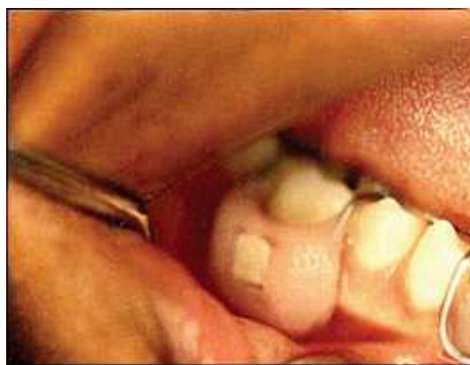
Figure 1. It shows a patient wearing the intraoral appliance with the enamel slab

consisted of 3.1 mmol/L calcium chloride, 3.1 mmol/L sodium dihydrogen orthophosphate and 50 mmol/L glacial acetic acid. pH of the solution was adjusted to 4.5 using 1 mol/L sodium hydroxide. This method produced artificial lesions similar to natural white spots. 10 Lesion depths were approximately 120 µm. The enamel cores were removed from the lucite rod and cut to a 3-mm thickness to give a 4 × 4 × 3 mm slab. The enamel slabs thus produced and were incorporated in the left and right buccal flanges of specially fabricated appliances. The appliance design was a modification of the original intraoral cariogenicity test appliance designed by Koulourides. 12 The appliances were designed to hold two enamel slabs in different proximal positions adjacent to natural teeth (Figure 1). The dentifrices used for this investigation were: (1) dentifrice containing 1000 ppm sodium monofluorophosphate and a fluoride-compatible silica abrasive system (2) a non-fluoride-silica abrasive placebo. Dentifrices were formulated to be similar in color and flavor and were packed in 5-oz. white tubes.