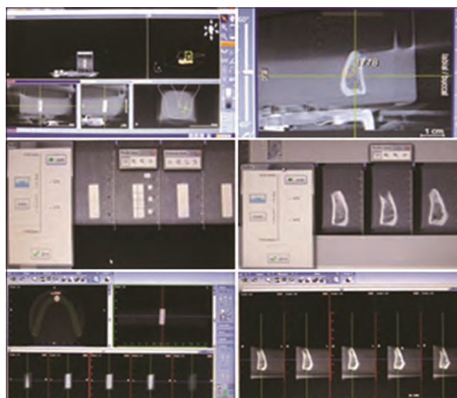
Figure 3: (a) CBCT images of cylindrical samples and bone pieces in Galileos 3D (b) NewTom 3G (c) Promax 3D