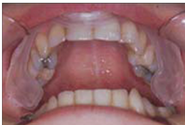
Figure 1: Self-adjusting oral splint in occlusion

Aqualizers are available in three different vertical dimensions: Low, medium, and high [Figure 3]. The amount of fluid in the Aqualizer™ controls the vertical dimension (thickness). Medium volume aqualizers are used in most of the cases. Low volume aqualizers