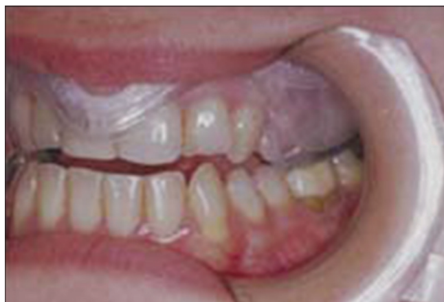
Figure 2: Oral splint with fluid (water-filling) in occlusion

Instruct patient not to take medication for facial jaw pain the day of the appointment. Rule out organic pathology and confirm adequate posterior occlusal support. Remove Aqualizer™ from package and insert in to the mouth. No preparation of the bite splint is necessary. Instruct the patient to keep the fluid pads between the posterior teeth [Figure 4]. The patient should relax and rest their teeth against the fluid pads while swallowing. It is not desirable