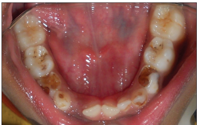
Figure 11: Pre-operative view of mandibular arch showing decayed 84