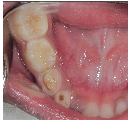
Figure 12: Final tooth preparation and pulp protection with glass ionomer cement

The management of totally broken down primary teeth is carried out in two phases; core build up followed by restoration of the crown anatomy. A multitude of methods has been used for intra-canal reinforcement for anterior teeth such as composite posts, [1] short wire posts (omega loop), [8] Ni-Cr coil spring posts, [2] readymade glass fiber posts, [9] ribbond [10] and dentinal posts. [11] The crown anatomy can be restored by direct composite build up by incremental method, [8]