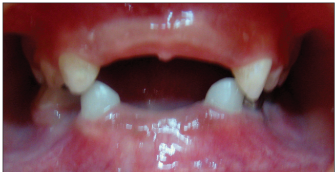
Figure 10: Post-operative view