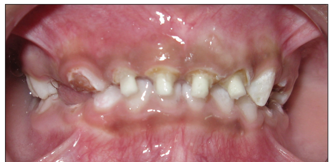
Figure 3: Dentine posts cemented in place