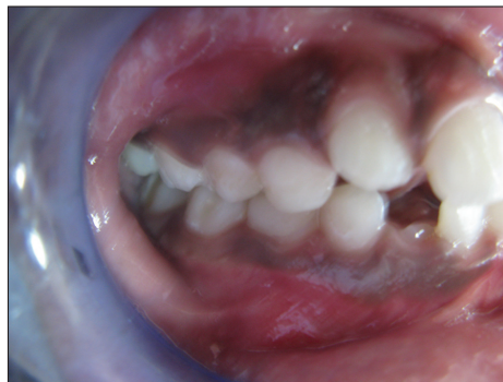
Figure 14: Final post-operative view showing teeth in occlusion

composite build up using celluloid strip crowns, [1,9] composite build up by indirect technique, [2,10] open faced stainless steel crowns, [3] resin veneered stainless steel crowns, [12] enamel veneers and biological shell crowns. [9,13]