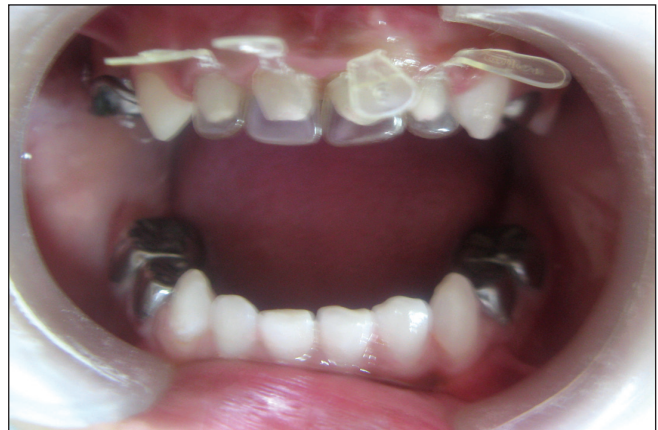
Figure 4: Trial fit of strip crowns

Step 5: Cementation of post and core unit was done in a similar way as described for the previous case [Figures 8 and 9].