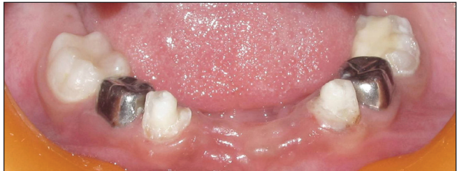
Figure 9: Dentine post and core units cemented in place. Appreciate the amount of tooth structure replaced with these post and core units, which needed application of minimal thickness of composite during final buildup