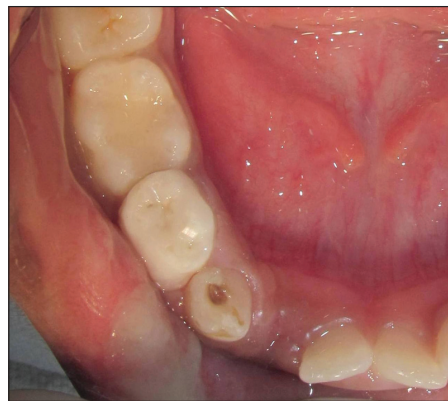
Figure 13: Trial fit of biologic shell crown. Note the occlusal disharmony at distal marginal ridge at this stage. Significant trimming was done, mainly at cervical margin, to ensure proper seating. Also, note the improper mesial contour, which needed minor adjustments