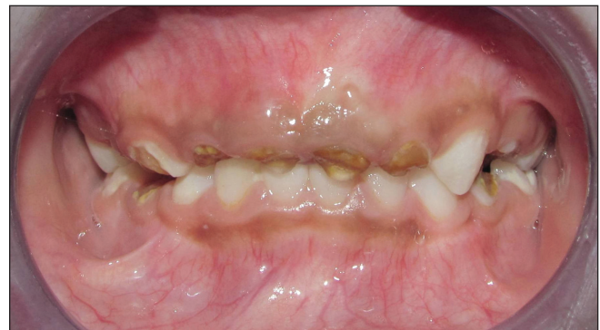
Figure 1: Pre-operative view showing decayed maxillary incisors

Step 7: Filtek™ Z350 XT supreme universal restorative (3M™/ESPE™ Dental Products, USA) composite material was condensed in celluloid strip crowns with due care being given not to entrap any air bubble. It was seated on incisor to be restored and extra composite material was removed from gingival margins and palatal hole before curing. Curing was