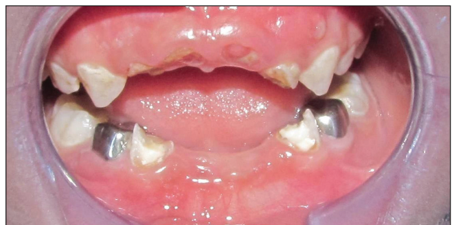
Figure 7: Intra-oral photograph showing 73 and 83 after endodontic intervention. Note the minimal amount of remaining tooth structure