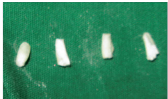
Figure 2: Prepared dentine posts. Note almost cylindrical shape of posts