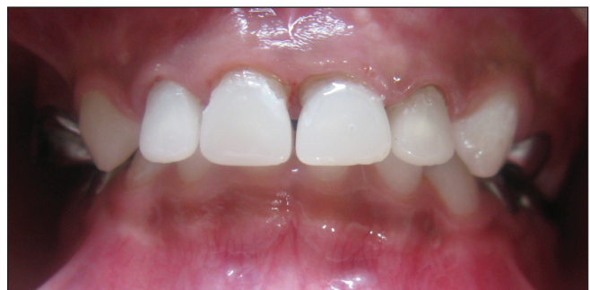
Figure 6: Post-operative view at 12 months follow-up