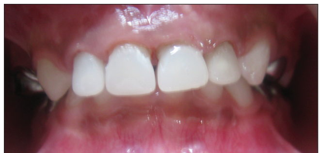
Figure 5: Post-operative view of restored maxillary incisors