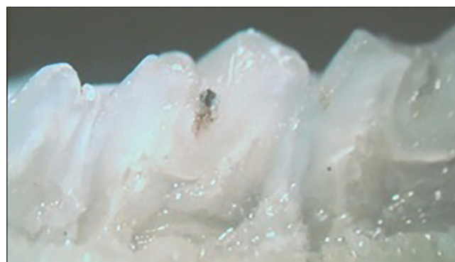
Figure 2: The rat second molar sectioned mesio-distally at the central fissure.

‡ Significant difference between caries scores of molars in all the groups through Kruskal-Wallis test; *Significant difference between the control and milk groups through Mann-Whitney test ( P = 0.004 ); **Significant difference between the control and yogurt groups through Mann-Whitney test ( P = 0.000 ).