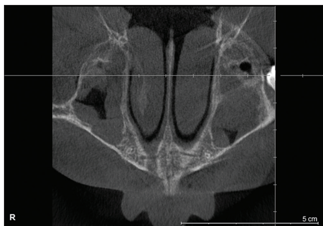
Figure 1: Displacement of the third upper molar in the axial view.