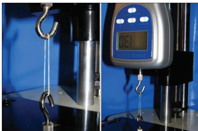
Figure 2: The digital gauge with an elastic band staked on its hooks. The magnitude of the required force F is measured.

in the force relaxation were not the same for all groups. The interaction between pH and time showed no significant differences ( P > 0.05 ) except at 36 h ( P < 0.05 ). We employed one-way ANOVA/Tukey's tests for subgroup (between group) comparison. The post-hoc Tukey's test was used among different groups and times. The further analysis showed that each comparison between any two groups did not indicate significant differences ( P > 0.05 ) except between Groups 1 and 3 ( P < 0.05 ) and between Groups 2 and 3 ( P < 0.01 ) [Table 1]. Even though no significance was found, in the first 4 h, the force decay of the Group 4 was 10% of their initial force [Figure 3], exhibiting the changes in the percentage of the initial force during the 48 h of the experiment in four groups. It is a representative force-time curve of elastics immersed in different pH levels. It shows a curve with four distinct phases of force decay: A high initial rate and the second lower rate of force degradation and the third slight force increase from 24 to 36 h and the fourth high rate of force decay. The percentage of the initial force remaining after 48 h was around 89.36% in Group 1, 81.41% in Group 2, 86.45% in Group 3, and 79.53% in Group 4.