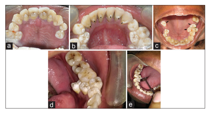
Figure 2: (a) Multiple talon cusps involving the palatal aspect of maxillary anteriors. Note the double talon cusps involving maxillary centrals. (b) Trace talon cusps involving the lingual surface of mandibular anteriors (black arrows). (c) Supplemental supernumeraries of maxillary arch (black arrows). (d and e) Supplemental supernumeraries of mandibular arch.

is commonly associated with clover leaf deformity of skull. Other features of this disorder include macrocephaly, short ribs, brachydactyly, narrow thorax, and distinctive facial features. However, the majority of the clinical features in the present case were in favor of achondroplasia, and all the features were evident in the early childhood.