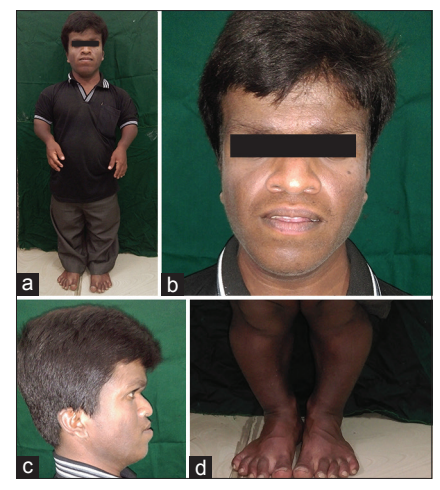
Figure 1: (a) Photograph showing a rhizomelic dwarf. (b) Facial photograph showing ocular hypertelorism. (c) Lateral facial profile showing large head, frontal bossing, depressed nasal bridge and concave facial profile. (d) Bowed legs.

Hypochondroplasia and thanatophoric dysplasia are the two disorders that can be considered as a differential diagnosis for the present case. Hypochondroplasia is a syndrome which is very much similar to achondroplasia but all the features are milder and are usually not manifested until late childhood. Thanatophoric dysplasia is another cause for short-limb dwarfism which results due to a mutation in FGFR3 gene. There are two types: Type I is characterized by micromelia with bowed femur and rarely with clover leaf deformity, and Type II is characterized by micromelia with straight femurs and