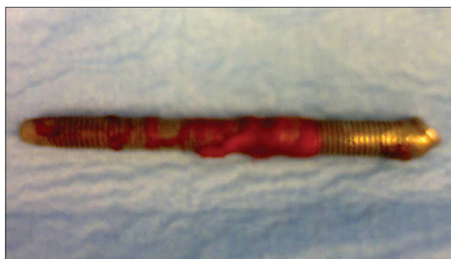
Figure 3: Extracted zygoma implant following perimplantitis.