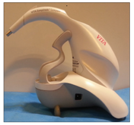
Figure 3: Spectrophotometer device (Vita Easyshade).