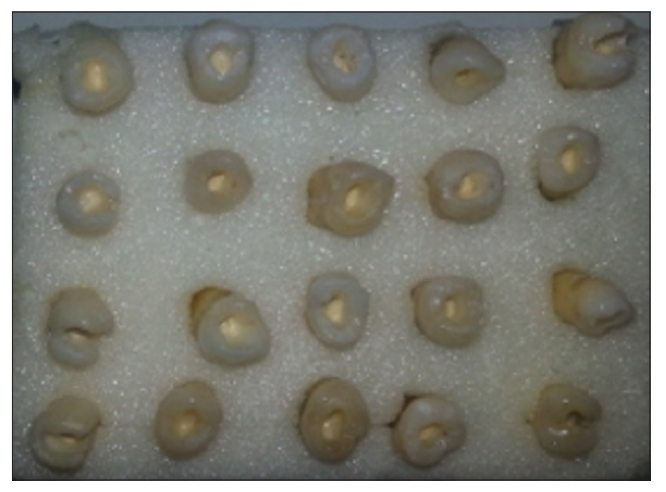
Figure 1: The samples after placing the endodontic material.

The data were analyzed using SPSS version 18 (SPSS Inc., Chicago, IL, USA). \Delta E1 was defined as