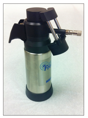
Figure 1: Cryocan.

First, the endodontic micromotor and contra-angle handpiece (16:1, Endomate DT, NSK, Japan) were