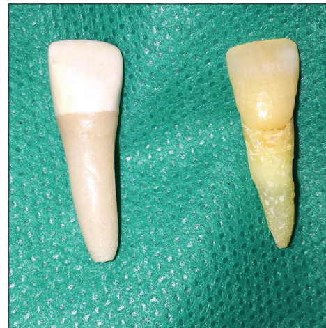
Figure 3: Maxillary central incisor (labial view).