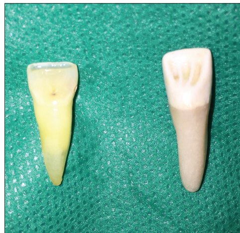
Figure 4: Maxillary central incisor (palatal view).