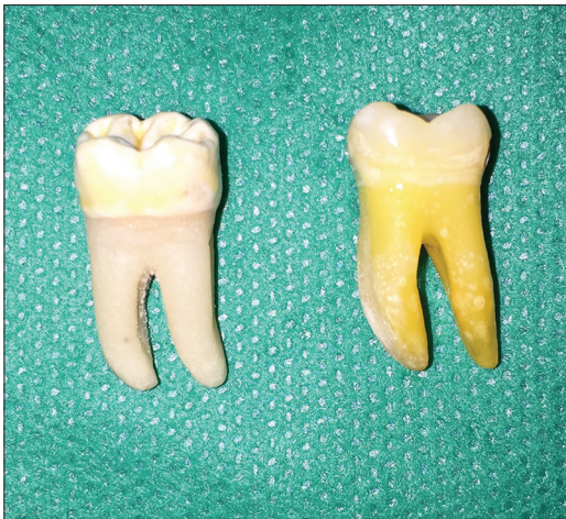
Figure 5: Mandibular first molar (lingual view).