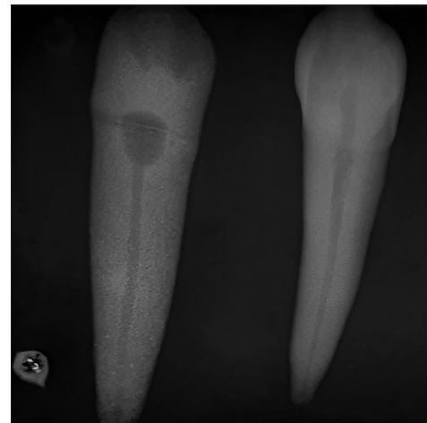
Figure 9: Maxillary canine radiograph.