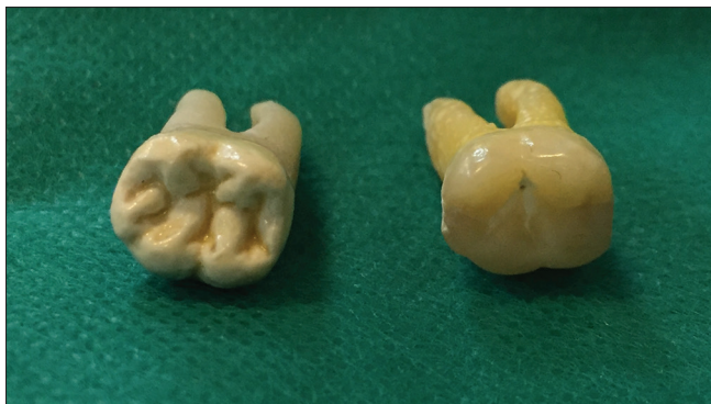
Figure 7: Mandibular first molar (occlusal view).