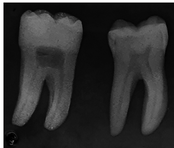
Figure 10: Mandibular first molar radiograph.

high-speed handpiece. The step-by-step preparation process of the model is presented in Figure 11a-f. This reaction simulated the bleeding of the pulp. After placing this tissue within the tooth, the crown and the root were attached with acrylic resin. Then, the tooth was covered with a transparent resin to look like a real tooth with enamel.