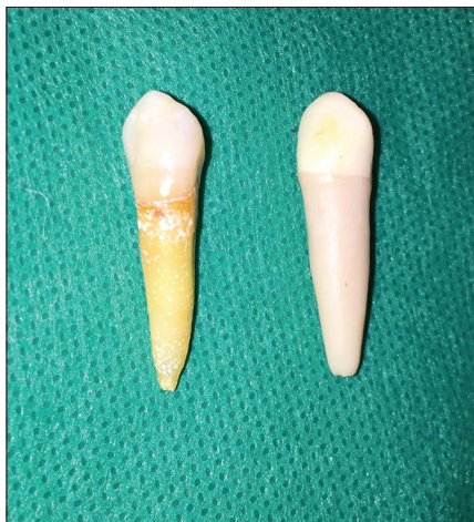
Figure 1: Maxillary canine (labial view).

procedure separately. Double silicon impressions were taken for roots, and a single silicone impression was taken for crowns. After tooth impression procedures, the artificial tooth material was prepared. Acrylic resin was used to this end, and the filler was a mixture of barium sulfate and aluminum oxide (at a ratio of 3:2). The filler served as an opacifier as well. Before casting the resin, some space was left for the pulpal tissue. To this end, it was necessary to use a flexible metallic instrument like a dental file. The file was placed in the middle of the tooth; then, the resin was cast. After the resin was set, the file was removed, and the root canal was fabricated. Following the fabrication of the root and the crown, the orifice of the canal was slightly widened with a diamond bur. It was also necessary to prepare a space similar to the pulp chamber on a radiograph. [Figures 8-10] Orifices widened proceeded by placing a coloring agent in the canal. A type of tissue was used, which colors the pulp when it is exposed to the water from the