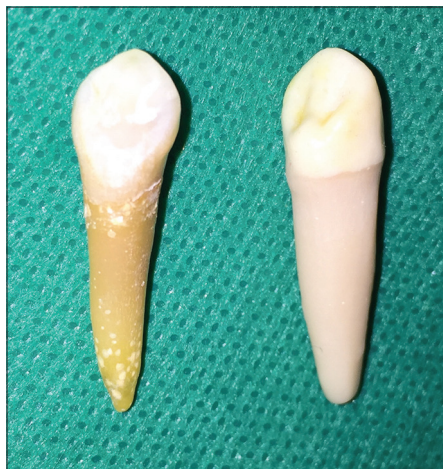
Figure 2: Maxillary canine (palatal view).