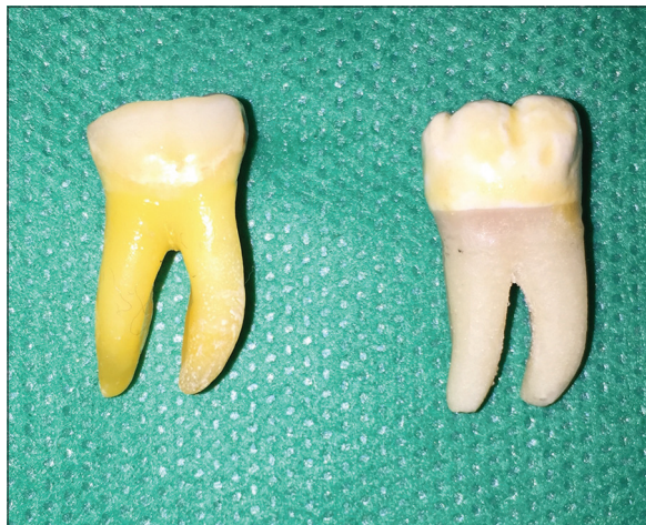
Figure 6: Mandibular first molar (buccal view).