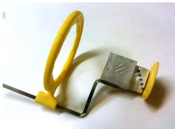
Figure 1. XCP with built-wedge steps.

provide different density on radiographs as a reference, the atomic number of aluminium is similar to the effective atomic number of bone. 29 By making the similar density of step wedge with computer software on consecutive radiographs similar density is provided on the background of all films and we can measure the difference in density around the implant during bone healing. For using the density-standardizing aluminium step wedge by XCP film holder a metallic device was made from aluminium and it was placed on XCP film holder between its metallic arm and plastic film holder. This device consist of a density-standardizing aluminium step wedge on an aluminium base plate and a upper plate of aluminium with some guide slots created on its surface for further establishment of bite register material and this plate is connected to the base plate by two lateral walls and the empty space between upper and base plates prevent superimposition of the dentition over step wedge image when the patient bite on the impression bite register material. In this way constant radiographic geometry and standard densitometry of radiographs was possible (Figure 1). Also, to provide the same geometric condition for consecutive radiography, impression material is required to be able to repeat the film's position in the patient's mouth constantly.