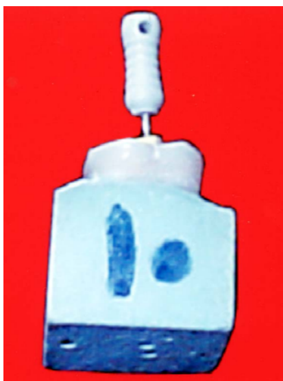
Figure 1: Measurement of canal length.

speed periapical radiography film (Dental Intraoral E-Speed Film, Kodak, USA). The tube was set at a distance of 4cm (same as digital radiography) and all the samples were radiographed in this manner (figure 2).