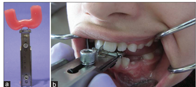
Figure 2: (a) Calibrated appliance is ready to come together with the fork and wax. Then it is ready to use. (b) The patient has located her front teeth in the predetermined position. Note the vertical, horizontal, and anteroposterior control of the appliance